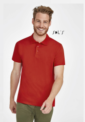
PRESCOTT MEN 11377